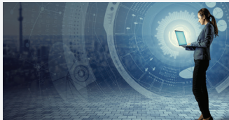
Autonomous Wave Control (AWC)

is well suited to both IoT and SDN-enabled networks. AlliedWare Plus provides Fini with superior networking functionality, strong management capabilities, and exceptional performance and reliability. In addition, AlliedWare Plus provides complete access edge security.